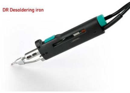
DR Desoldering iron