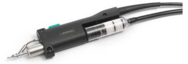
DS Micro desoldering iron