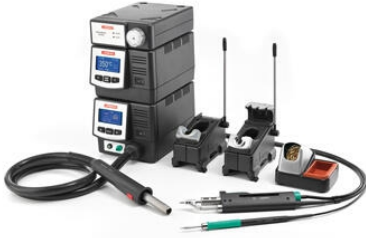
RM Rework station